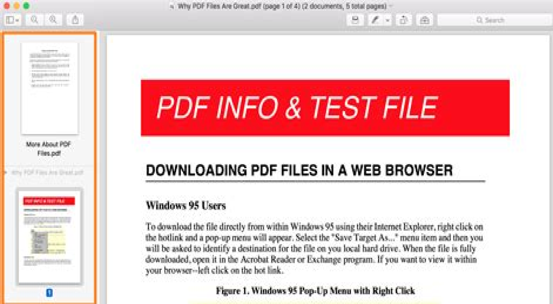
Figure 1. Windows 95 Pop-Up Menu with Right Click