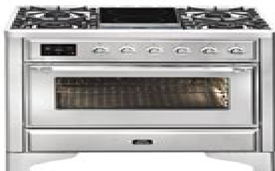
Pictured in Stainless Steel & Chrome Trimmings - M09IDNE3-SCC