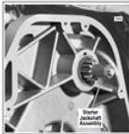
Figure 5-21. Primary Chaincase

If only the jackshaft bolt, thrust washer, lockplate, pinion gear and/or spring require servicing, then the primary chain and clutch assembly may be left in place.