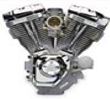
1999-2006 Twin Cam 88 1,450 cc 80 hp