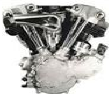
1936-1947 Knucklehead 990 cc & 1,200 cc 40 hp & 45 hp