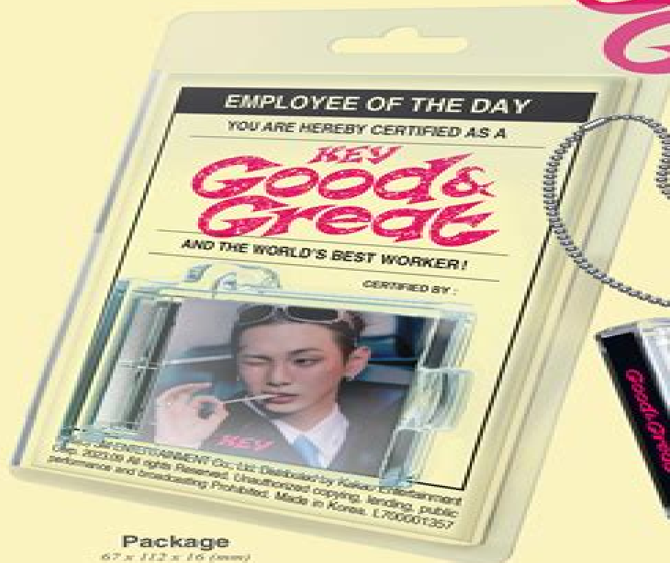
Package 67 x 112 x 16 (mm)