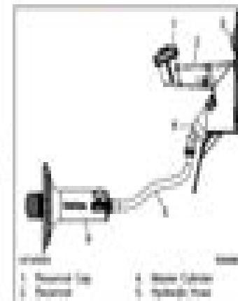
Fig. 5 Clutch Hydraulic Fluid Level Checking 1. Reservoir Line 2. Reservoir Line 3. Reservoir Line 4. Reservoir Line

If the fluid level is below the MIN line, fill the reservoir with DOT 3 brake fluid until the level reaches the MAX line. See Fig. 5.