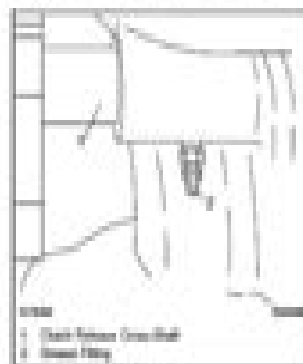
Fig. 3 Clutch Release Cross-Shaft Grease Fitting

The clutch release cross-shaft is equipped with two grease fittings in the transmission clutch housing. See Fig. 3 and Fig. 4. Wipe the oil from the grease fittings and lubricate with multipurpose chassis grease.