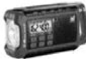
Emergency Crank Radios