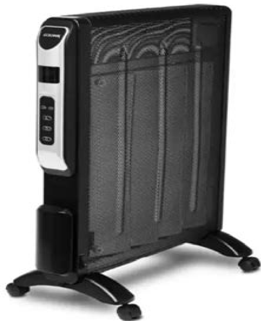
Main Body x 1