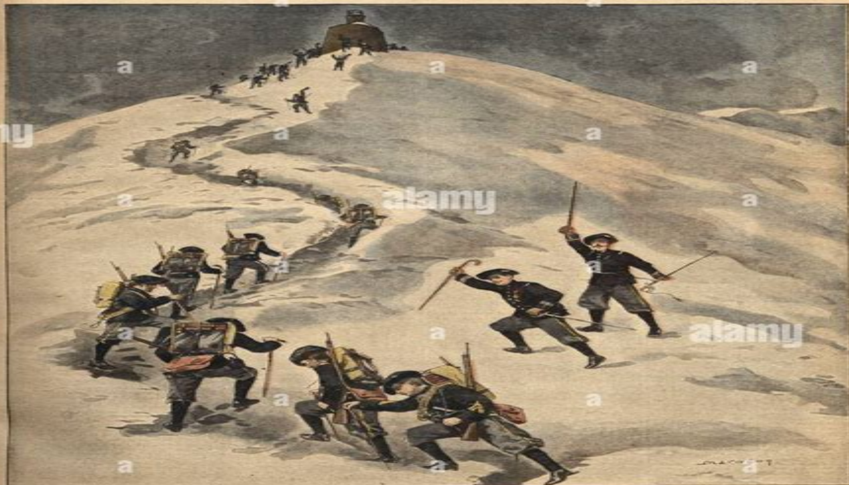
LES CHASSEURS ALPINS AU MONT BLANC