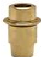
C630 Nickel/ Bronze