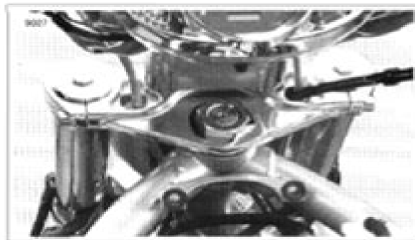
Figure 1-43. Steering Head