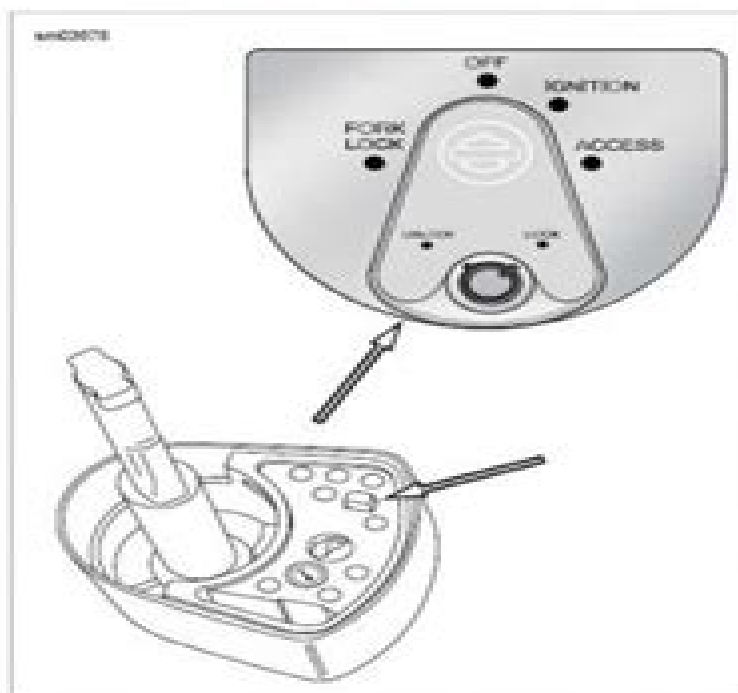
Figure 8-60. Ignition Switch Knob Release Button (Top and Bottom Views)