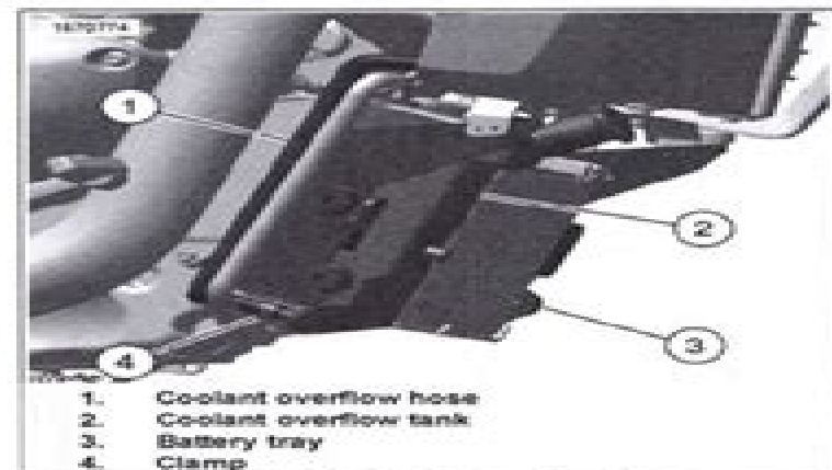
Figure 7-13. Coolant Overflow Tank