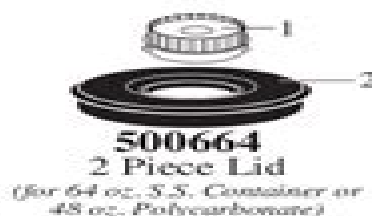
500664 2 Piece Lid (for 64 oz. S.S. Container or 48 oz. Polycarbonate)