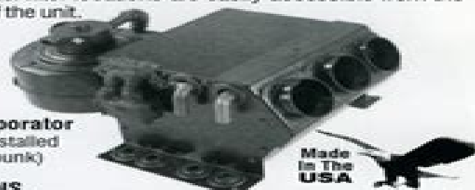
APU Evaporator (To be installed under bunk)

The Frigette System really looks like true "truck equipment" with its step box design. (Footstep is available as an option) Oil, air and fuel filter locations are easily accessible from the top or front of the unit.