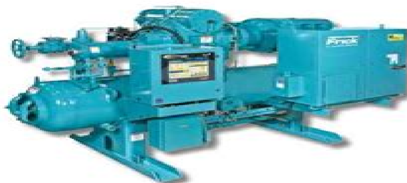
RWF II with mounted Vyper™ Variable Speed Drive