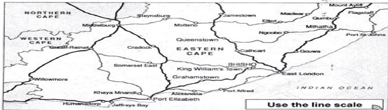
Figure 2: A map of the Eastern Cape

We can also give the scale in words, for example one centimetre on the map represents one kilometre on the ground. This is a word scale.