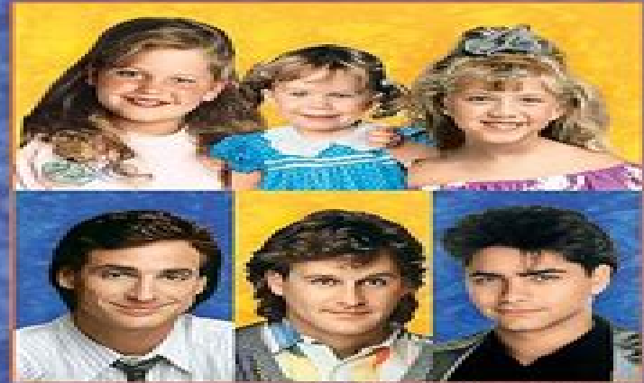
THE COMPLETE SECOND SEASON