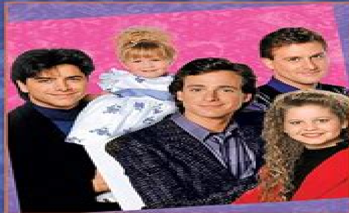
THE COMPLETE THIRD SEASON