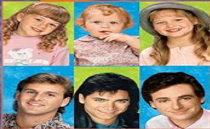
THE COMPLETE FIRST SEASON