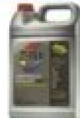
Zerex® Extreme Life Antifreeze & Coolant