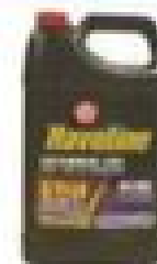
Kendall® Extended Life Antifreeze & Coolant