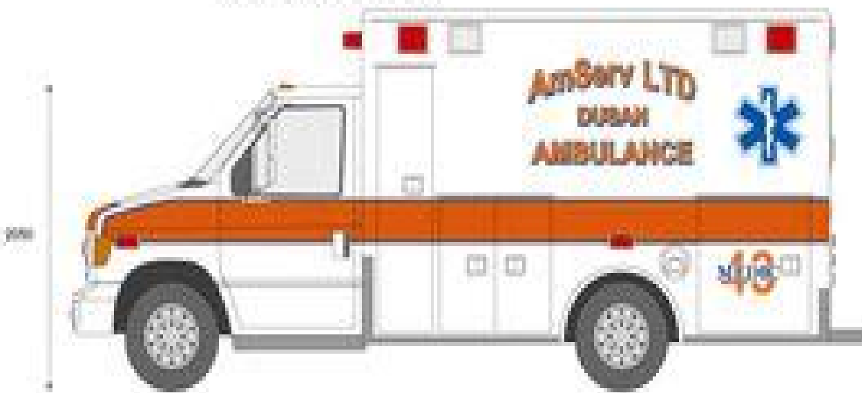
Ford E-350 Ambulance