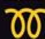
Engine management lamp