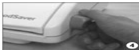
Close and Latch Lid