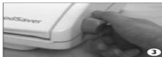
Close and Latch Lid