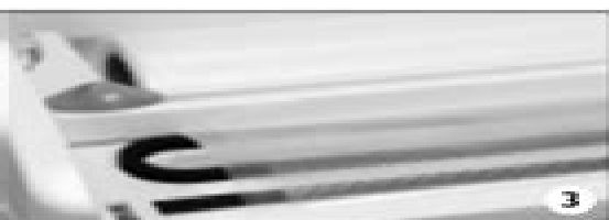
Place Bag Material on Sealing Strip