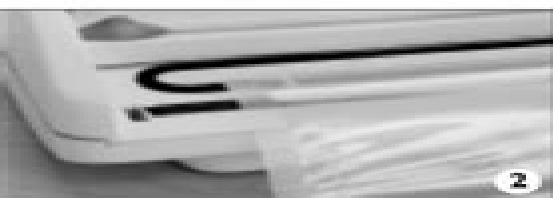
Place Bag in Vacuum Channel