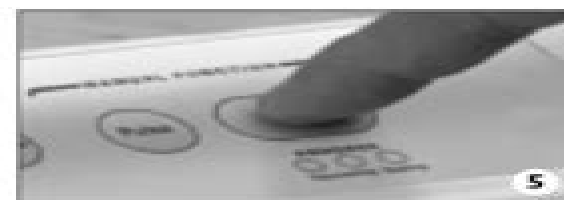
Press Seal Button