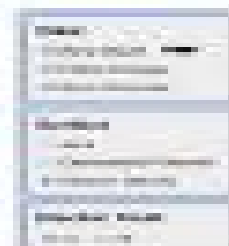
Figure 1: Finding the Radius of a Sphere

Now, let's use the sphere model to find the distance from the center of the sphere to the dot. We will use the radius of the sphere to find the distance.