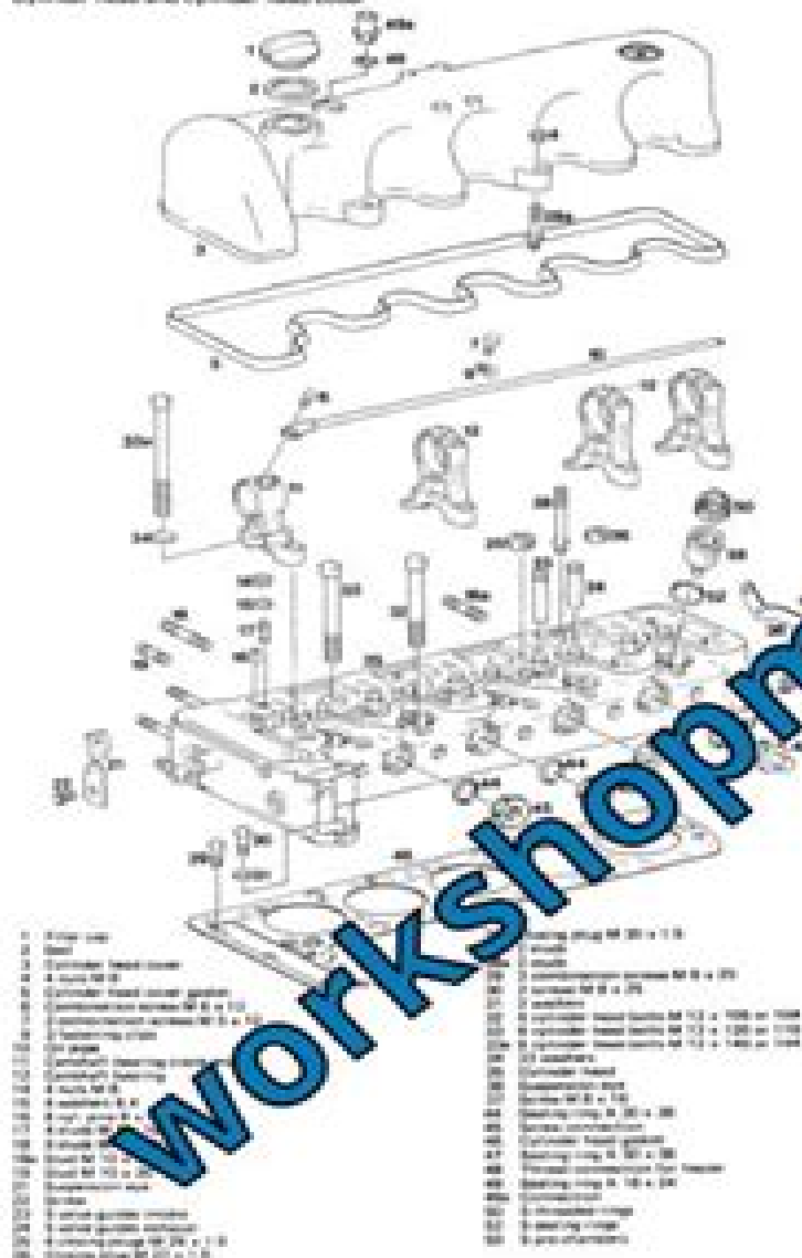
Cylinder head and cylinder head cover

5. When using rigid-type valve guides, press against the manual thread through base hole in cylinder head.