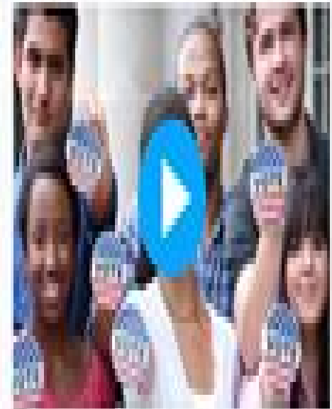
The Fight for Voting Rights