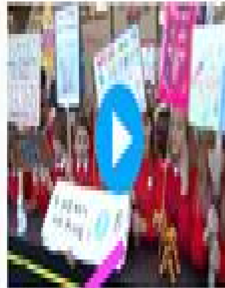
Marching for the Planet