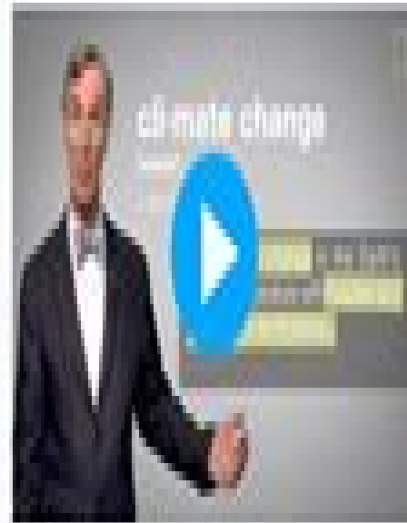
All About Climate Change