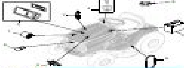
Tractor B/N _____