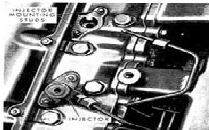
Figure 7 Diesel Engine Injector Removed