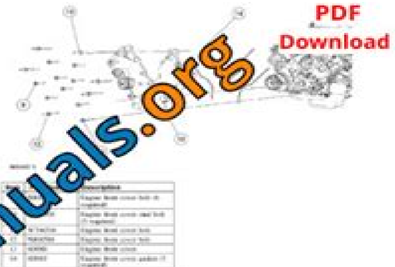
Fig. 28: Identifying Engine Front Cover Components (2 Of 2)