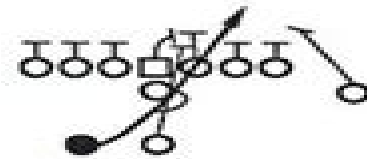
G H10 LEAD