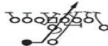
G H40 ICE