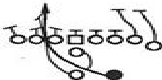
G H13 BILL