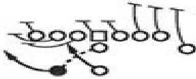
G H39 TOSS