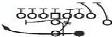
G H59 CNTR