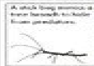
A stick insect mimics a tree branch to better escape predators.

Outside adaptations are called structural. This can include a turtle's shell, quills on a porcupine, shark teeth, or a giraffe's long neck. These all help the animal in its habitat. Also included in structural adaptations are camouflage, when an animal seems to blend into the area; and mimicry, where an animal looks like something different like a leaf, or predator.