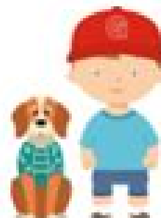
Polly Punctuation & Grammar Gabe