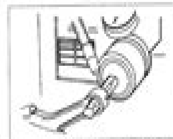
Figure 13: Finding the Corresponding Real Power for Real Power

Downloaded from http://www.jstor.org/stable/2346090