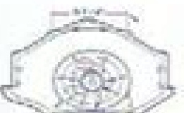
GM TH-400, 350, 250-48, 700R4, 3.80, 4.10, 4.62R Chevrolet