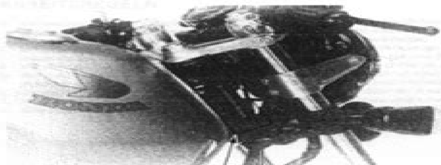
(1) The frame serial number is stamped on the steering head right side.