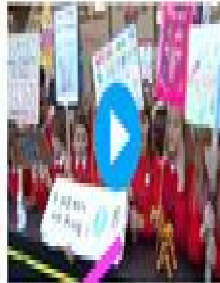
Marching for the Planet