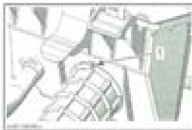
1. Intake elbow (2 pieces) - Assembled and 2. Air filter housing