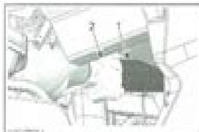
1. Intake elbow (2 pieces) - Assembled and 2. Air filter housing

5. Disconnect vent hose from the rear of air filter housing.