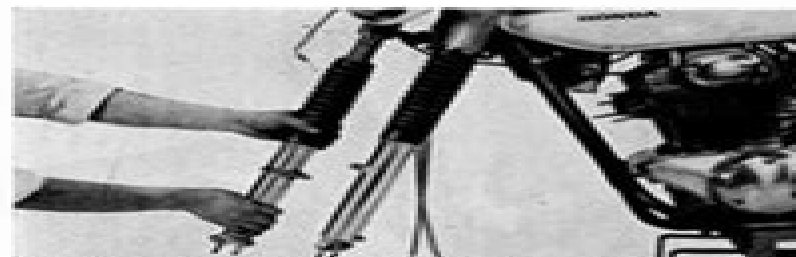
Abb. 4-27. Anbringung der Vordergabel