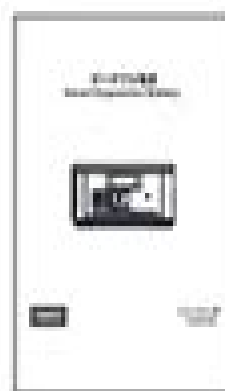
User Manual *1