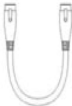
Parallel connection Wires *1