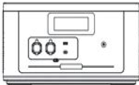
B2000 Smart Expansion Battery *1