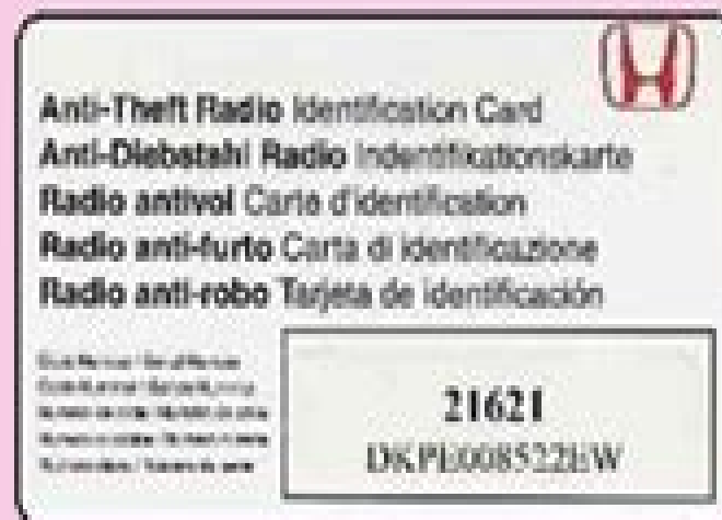
Anti-Theft Radio ID Card