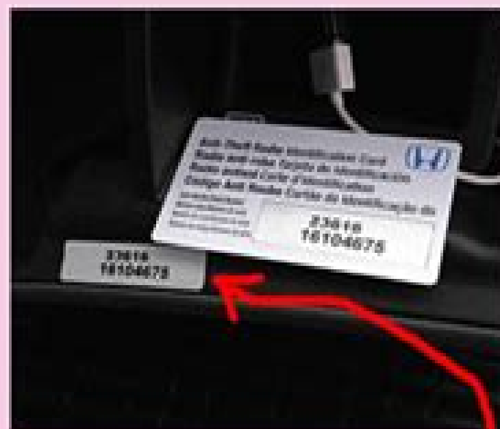
In this case, the radio code is : 23616