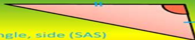
Side, angle, side (SAS)