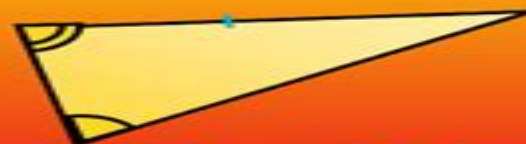
Angle, angle, side (AAS)