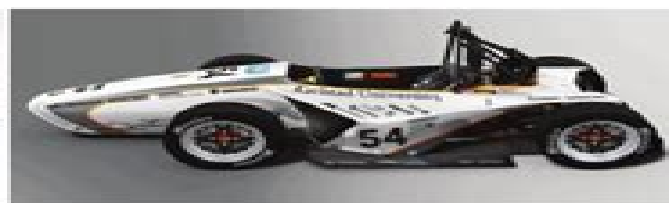
Fig.1 Formula Student Vehicle - construction and final result