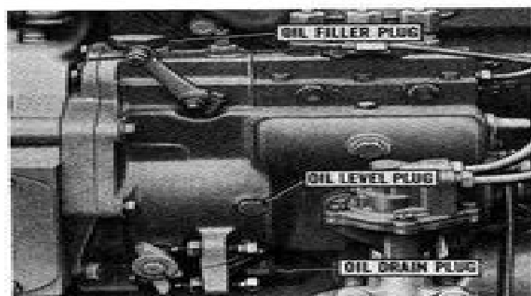
Fig. FO521 — Lubricating oil must be maintained of proper level and be changed at regular intervals on mechanical governor type fuel injection pumps. Drain, fill and oil level plug locations are shown. Refer to paragraph 29.