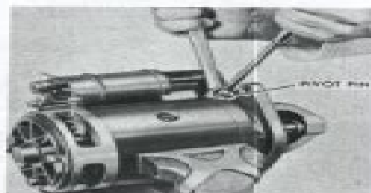
Fig. 134—Adjusting drive pinion clearance; refer also to Fig. 133 and to text.