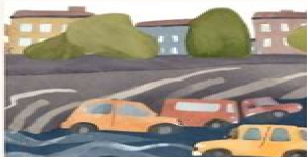
Flood water flowed many vehicles in a city area.