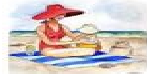
PUT ON SUNSCREREN