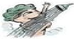
TAKE A SHOWER