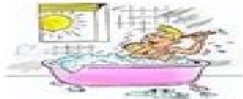
TAKE A BATH