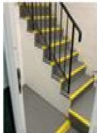
Stair Edge Markings