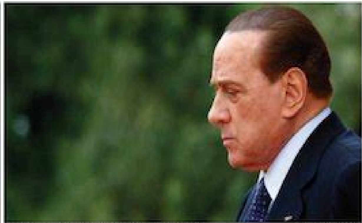
Silvio Berlusconi has recently experienced several political setbacks.

Seven hopefuls took part in the largest Republican debate so far, with less than a year and a half to go until the US presidential election.