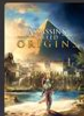
Assassin's Creed Origins 4 install