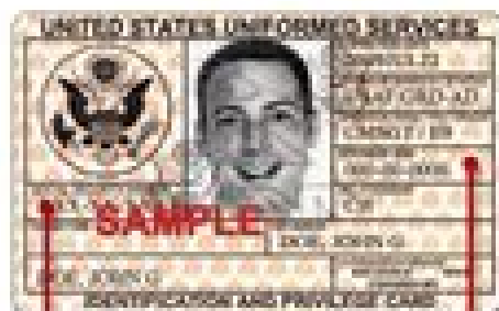
DD Form 1173