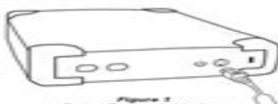
Figure 1 Power Connector Hook-up