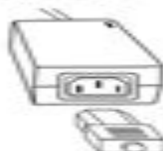
Figure 2 Power Adapter Hook-up